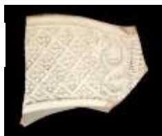
White salt-glazed Stoneware (dot, diaper & basket)