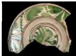
San Luis Polychrome