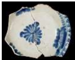
Puebla Blue on White